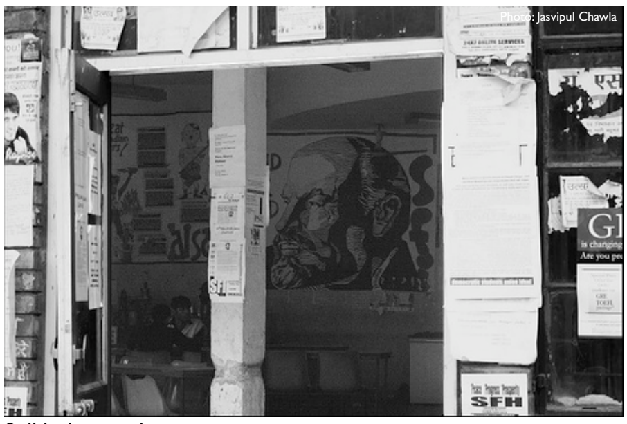
Still lurking in the canteen

The curriculum of the 'development studies' and 'social work' programmes that are offered in the universities across India contains just one or two courses on basic economics. Surely develop-